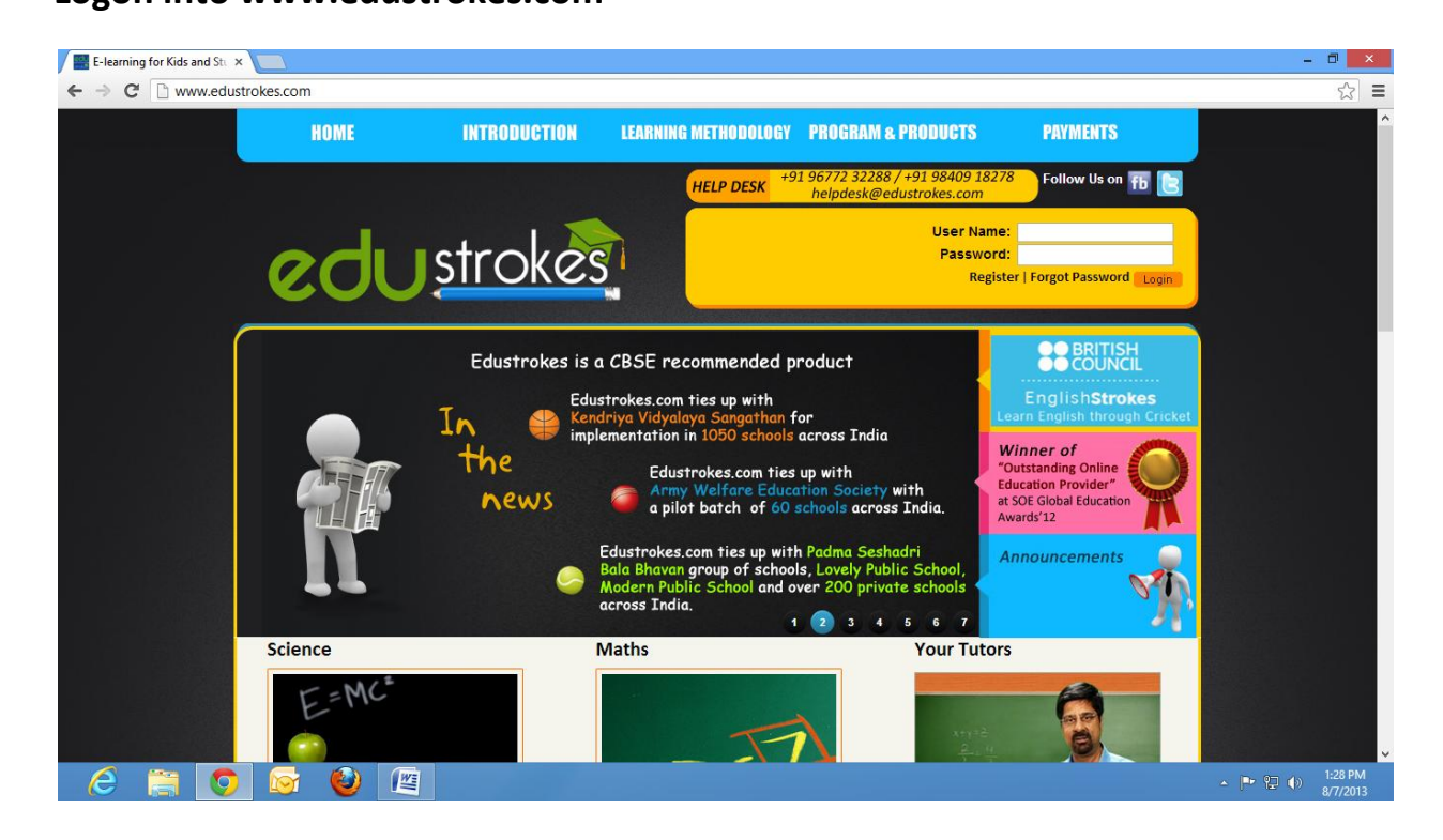
Step 1: Logon into www.edustrokes.com